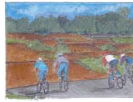
Conceptual drawings produced by Alaback Design Associates show just a few of the many activities that could come to Mohawk Park, if suggestions made by the park's new master plan come to fruition.